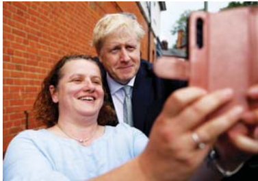
Boris Johnson, a leadership candidate for Britain's Conservative Party, poses for a selfie in Oxshott, Surrey, Britain, yesterday.

next leader of the Conservative party will be made on Tuesday, 23 July. This process has been agreed with both candidates," the statement said.