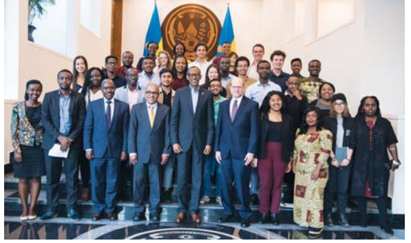
Carnegie Mellon University students pose for a group photo with the President of Rwanda, Paul Kagame.

Carnegie Mellon Qatar opened its doors in 2004, and offers undergraduate programs in biological sciences, business administration, computational biology, computer science and information systems. CMU-Q students are globally-minded, with more than half travelling for study, service or personal development during their undergraduate years.