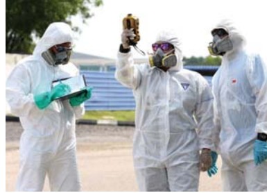
Emergency personnel wearing protective suits check the air quality in Pasir Gudang, Malaysia, yesterday.

"We have to identify those responsible for causing the pollution and take stern action against them." Residents expressed anger over the latest toxic leak.