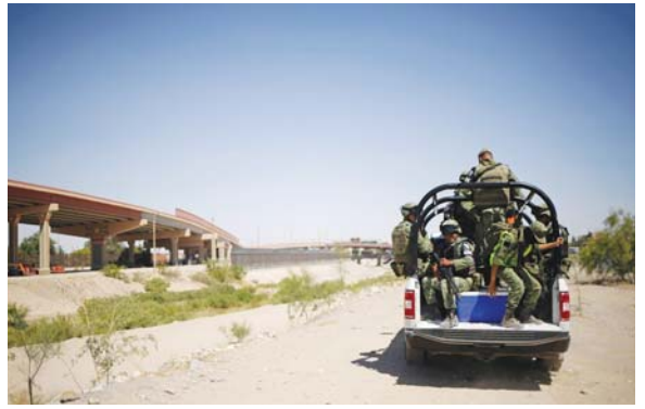
Members of Mexico's National Guard patrolling the border between Mexico and the US, in Ciudad Juarez, Mexico, yesterday.

The back-and-forth on the spending measure came as Congress' top Democrats criticised Trump for threatening coast-to-coast deportations of migrants