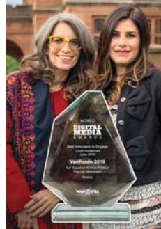
AJ+ officials with the award.

The World Digital Media Awards Ceremony took place on June 2, during WAN-IFRA's 71st World News Media Conference, in Glasgow, Scotland. After winning the LATAM Digital Award, Verificado 2018