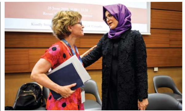
United Nations special rapporteur on extrajudicial, summary or arbitrary executions, Agnes Callamard (left), who issued a report of the killing of Saudi journalist Jamal Khashoggi, greets Khashoggi's fiancée and Turkish writer Hatice Cengiz at the UN Human Rights Council headquarters in Geneva, yesterday.

Egypt, Saudi Arabia, Morocco, Jordan and various Gulf states have sent finance officials to the workshop.