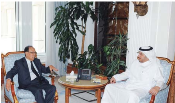
Prime Minister and Interior Minister H E Sheikh Abdullah bin Nasser bin Khalifa Al Thani met yesterday with the Chairman of the World Islamic Economic Forum, Tun Musa Hitam, and his accompanying delegation. They reviewed cooperation and means to boost them especially those related to Islamic economy. They also discussed topics of mutual interest.