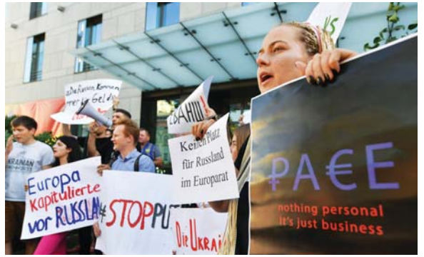
Activists hold placard as they shout slogans in front of the German embassy in Kiev, yesterday. Protesters demonstrated outside embassies of the countries that voted for Russia's return to Parliamentary Assembly of the Council of Europe (PACE).

It had even threatened to quit the body altogether if it was not allowed to take part in today's election, a move that would have prevented Russian citizens from being able to appeal to the European Court of Human Rights.