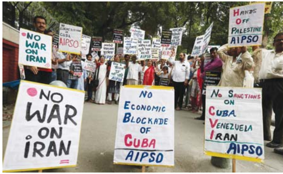
Demonstrators shouting slogans as they hold placards during a protest against US Secretary of State Mike Pompeo's visit to India, in New Delhi, yesterday.

The US is well aware of the reasons and the Indian government has explained the rationale behind the deal, the