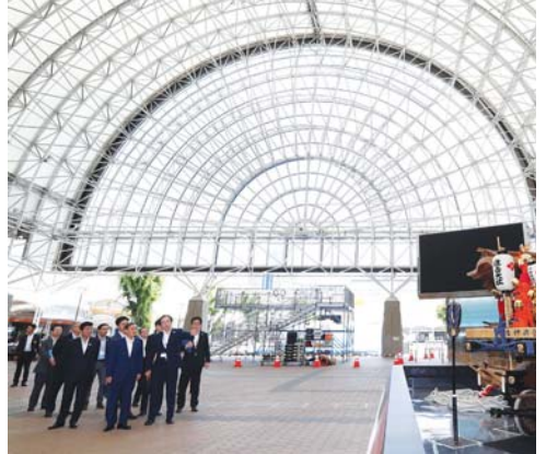
Japan's Chief Cabinet Secretary Yoshihide Suga during the inspection of INTEX Osaka, the G20 leaders summit meeting venue, in Osaka, Japan.

Getting future G-20 summits to focus productively on both, tactical and strategic, is much less of an engineering problem than a political one. The faster that's addressed, the greater the chance of the G-20 being more effective in supporting robust, inclusive growth and genuine global financial stability.