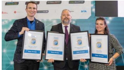
Qatar Airways officials with Airline Passenger Experience Association's Passenger Choice Awards at a ceremony in Istanbul, Turkey.