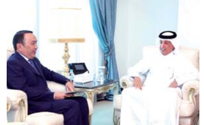
Amir H H Sheikh Tamim bin Hamad Al Thani received yesterday a written message from the President of the Republic of Kazakhstan, Kassym-Jomart Tokayev, pertaining to bilateral relations and the means to enhance them. The message was received by the Minister of State for Foreign Affairs, H E Sultan bin Saad Al Muraikhi, during a meeting with the Ambassador of Kazakhstan, Askar Shokymbayev. The Minister also met with Ambassador of Tunisia to Qatar Salah Al Salmi, on the occasion of the end of his tenure in the country, Ambassador of the French Republic, Frank Geely, and Ambassador of the Republic of Tajikistan, Sohibzoda Khisrav Sohib.