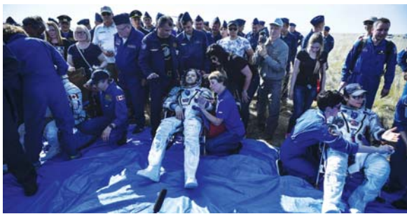
Russian cosmonaut Oleg Kononenko (centre), Nasa astronaut Anne McClain (right) and David Saint-Jacques of the Canadian Space Agency rest in chairs shortly after landing in a remote area outside the town of Dzhezkazgan (Zhezkazgan), in Kazakhstan, yesterday.

"I can think of no better person to serve the Administration & our country," Melania Trump wrote on Twitter.