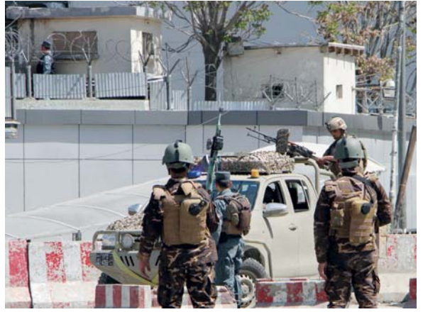
Afghan security forces take guard after an explosion followed by gunfire at the Ministry of Information and Technology of Afghanistan's main building, in Kabul, yesterday.

The Interior Ministry said in a statement that more than 2,800 employees of the Ministry of Communications and