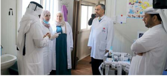
Qatar Fund for Development officials during the visit.

A high level delegation from Qatar Fund for Development (QFFD), visited the Za'tari camp in Jordan to oversee the situation in the camp and QFFD funded health programmes. Through the funding, QFFD aims to facilitate the inclusion of Syrian refugees and reduce pressure on services to host communities and increase capacity of health providers.