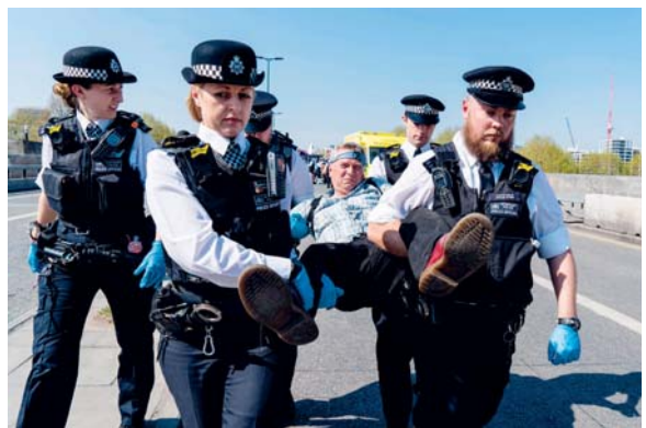
Police officers arrest and carry away a climate change activist from a demonstration blocking the Waterloo Bridge in London, Britain, yesterday.

Some politicians believe uncertainty over Britain's impending departure from the EU and the possible re-introduction of a "hard border" between Northern Ireland and the Republic of Ireland are stoking tensions in the region.