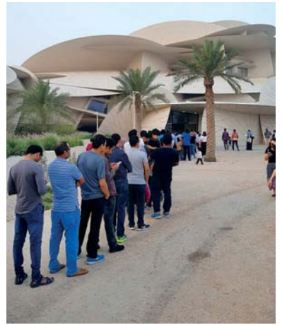
Visitors wait for their turn at NMoQ.

Critically acclaimed filmmaker Mira Nair tells visitors the story of pearl divers and the hardships they endure to bring home a seasonal income in the film Nafas (Breath) – a story beautifully told through the parallel journey of a couple brought