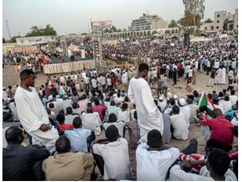
Sudanese protesters sit during a protest outside the Army headquarters in the capital Khartoum, yesterday.

The transition from one strongman to another suits not just those in charge, but also the two nations that have since 2011 emerged as much more powerful supporters of autocratic systems - Russia and China. Events in Sudan, Zimbabwe and Syria in particular have shown both countries capable of subtly shaping events,