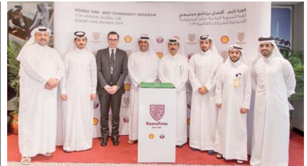
The officials during the event.