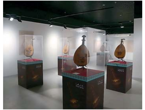
The exhibition will showcase antique Oud instruments made by legendary luthiers, and will also feature workshops on Oud manufacturing.

Katara's First Oud Festival, held in March 2017, was dedicated to Ziryab, the legendary musician of the Arab and