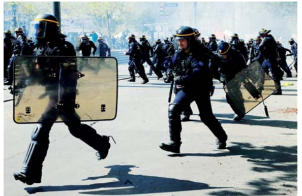
Police officers in riot gear run during a demonstration of the yellow vests movement in Paris, yesterday.

The Ukrainian leader attacked the inexperience of the untested Zelensky.