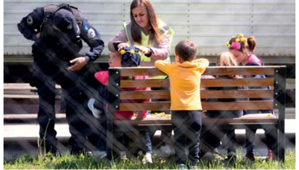
Kosovar children made crown of flowers with Kosovar police officers in the compound of the foreign detention centre in the village of Vranidoll, Kosovo, yesterday.

IS swept across a large swathe of Syria and Iraq in 2014, declaring a cross-border "caliphate" in areas it controlled. At the height of its rule, the extremist group imposed its brutal ideology on millions in territory roughly the size of the United Kingdom.