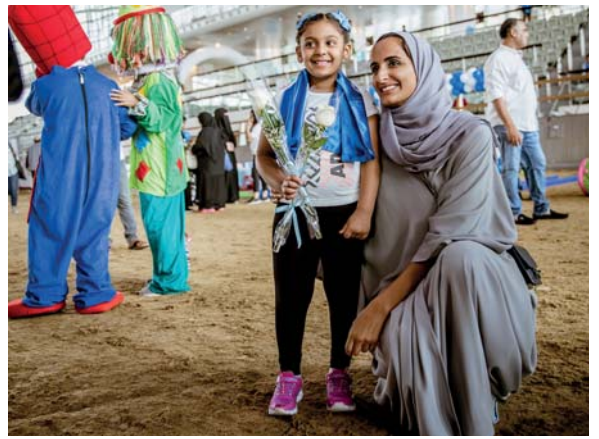
The Vice-Chairperson and CEO of Qatar Foundation, H E Sheikha Hind bint Hamad Al Thani, sharing a light moment with a child during the World Autism Awareness Day event at Al Shaqab yesterday.

World Autism Awareness Day was first proposed by Her Highness Sheikha Moza bint Nasser, Chairperson of Qatar Foundation, to the United Nations in 2007, and was adopted without a vote by the UN General Assembly. The first World Autism Awareness Day was celebrated on April 2, 2008.