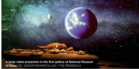
A large video projection in the first gallery of National Museum of Qatar.

together on land and separated for months by the sea.