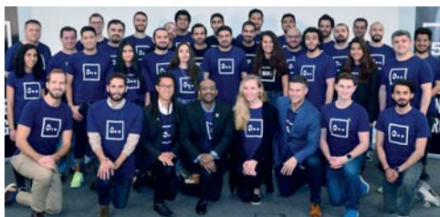
Mentors and participating teams of the third edition of the MENA Dojo Series A Program, organised by Qatar Science & Technology Park and 500 Startups.