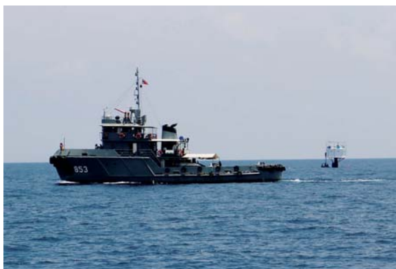
A floating home, lived in by an American man and a Thai citizen, is pictured in the Andaman Sea, off Phuket Island in Thailand, yesterday.

The apex court had recognised that even a "single mitigating instance, available in a particular case, would be sufficient to put on guard the judge not to award the penalty of death but to life imprisonment".