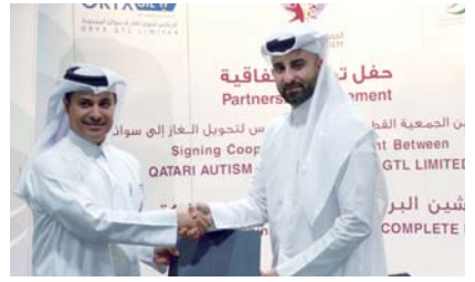
The officials of QAS and ORYX GTL exchanging documents after signing the agreement.

praised all the employees of the QAS for their tremendous efforts, and their relentless endeavours to integrate them with their peers in the community to overcome this disorder. QAS hopes to get technical and financial support by signing such agreement with governmental institutions and civil society organisations to approach Qatar vision 2030 as well as the Qatari Autism Society vision, and to let the society contribute in completing (One piece of Autism puzzle).