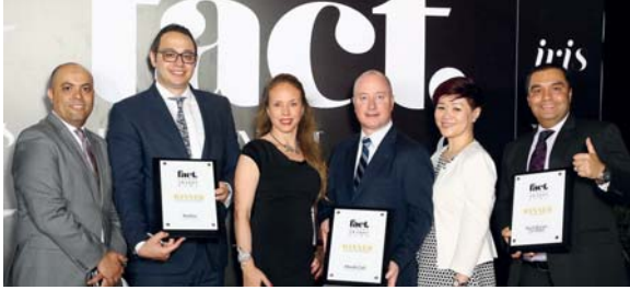
The officials of Crowne Plaza Doha - The Business Park & Holiday Inn Doha with the awards.

Outlets from the two hotels won the 'Favorite Latin American' for Rodizio Brazilian Churrascaria, 'Favorite Breakfast Restaurant' for Mesh Cafe and 'Favorite Pub in