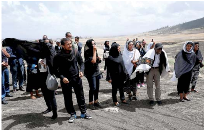
Family members of the Ethiopian Airlines Flight ET302 plane crash walk near the accident site during the mourning day to mark the 40th day in Gara Boka village, near Bishoftu town, southeast of Addis Ababa.

No amount of money can address this tragic loss of human life, but those responsible must be held to account. As we enter the contentious phase of determining liability and accountability, these are the human stories that should guide the conversation.