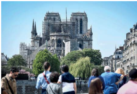
People look at the Notre-Dame Cathedral in central Paris, days after a fire engulfed the 850-year-old Gothic masterpiece, destroying the roof and causing the steeple to collapse.

The last artworks were taken out of the cathedral on Friday