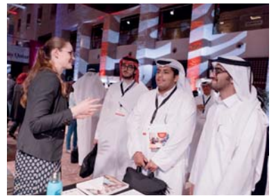
Students during the Marhaba Tartans event.

"When we selected you, we looked at your academic accomplishments, your extracurricular