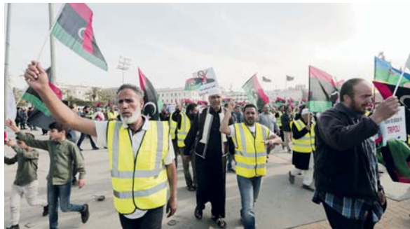
People attend a protest against Libyan military commander Khalifa Haftar's offensive to seize Tripoli, Libya, yesterday.

On the Baghdad summit, Sentop said: "The developments in Iraq have direct effects not only on Iraq itself but also on the countries of the region."