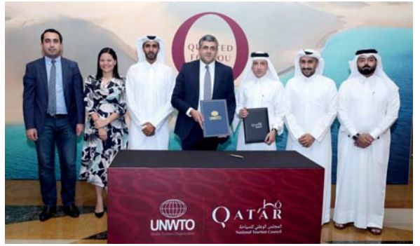
Akbar Al Baker, Secretary-General of Qatar National Tourism Council, with Zurab Pololikashvili, Secretary-General of the World Tourism Organisation, and other officials during the signing of the agreement.

generate opportunities and benefits for all." The agreement was signed as Pololikashvili began his first mission to Doha since taking office in 2018. A dinner was held to welcome Pololikashvili and his delegation, and to discuss the latest developments in Qatar's tourism sector, and the ongoing implementation of the National Tourism Sector Strategy: The Next Chapter 2018-2023. During their visit, the UNWTO delegation will be visiting tourism landmarks in Qatar and holding discussions with QNTC and other representatives of the public and private sector, exploring other ways the two organisations can exchange expertise and resources to support various programs that